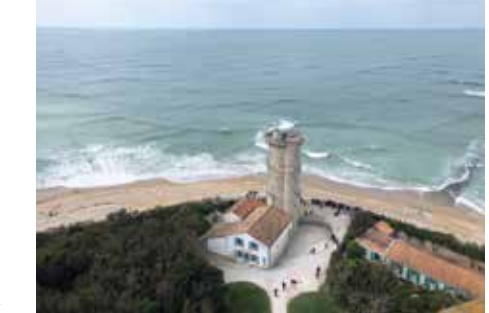
The Phare des Baleines on the Île de Ré

In the morning, I hopped on my electric rental bike and followed the breezy coastal path to Ars-en-Ré, a Plus Beau Village de France, to explore the morning market. Among flowery India cottons and raffia bags, the first strawberries of spring