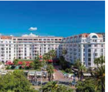
Indulge in all-out glamour and island views at Hôtel Barrière Le Majestic in Cannes

WHEN TO GO If you don't mind the crowds, both on land and at sea, summer is a