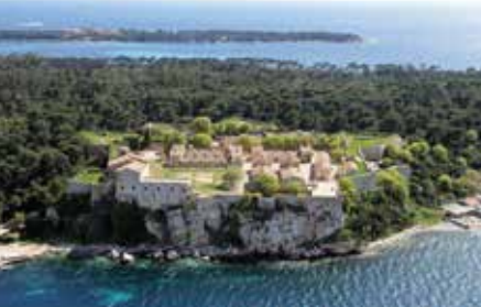
Fort Royal on Sainte-Marguerite

views of Cannes, the Alpine range and the Cap d'Antibes, repose in one of the island's three chapels, and visit the monastery's Gothic church and gift shop, stocked with Saint-Honorat wines and other artisan products. To taste the monks' seven vintages, stop in at the Lérina boutique at the ferry landing. Saint-Salonius (€95), made from 100% Pinot noir, is served to the jury of the International Film Festival and regularly served at Paris state dinners. Refreshing Saint-Pierre is a floral 100% Chardonnay and the shop's best bargain at €26.