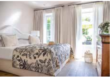
From top: Hôtel de Toiras and Villa Clarisse are both excellent accommodation choices